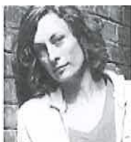
Sarah Harmer, Canadian Singer-songwriter, Activist

Thursday Big Bang Dinner + Award Keynote Performer